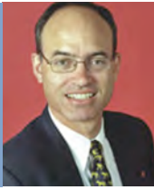
Former Liberal Senator Guy Barnett

take its place in July next year. Senator Barnett has been a staunch advocate for conservative causes since entering the Senate in 2002 including the right to life from conception to natural death.