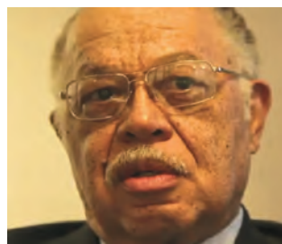
Dr Kermit Gosnell

State regulators ignored complaints about him and had failed to inspect his Women's Medical Society clinic since