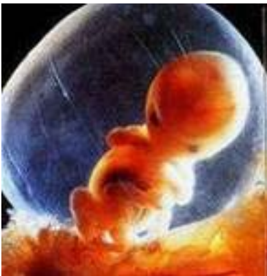
At Eight Weeks

Laminaria (dehydrated material, usually seaweed) is sometimes used to reduce damage to the cervix. Inserted into the cervix the day before the scheduled abortion, it absorbs water and swells, gradually pushing open the cervix in the process.